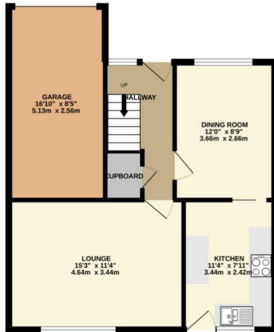
GROUND FLOOR 580 sq.ft. (53.9 sq.m.) approx.